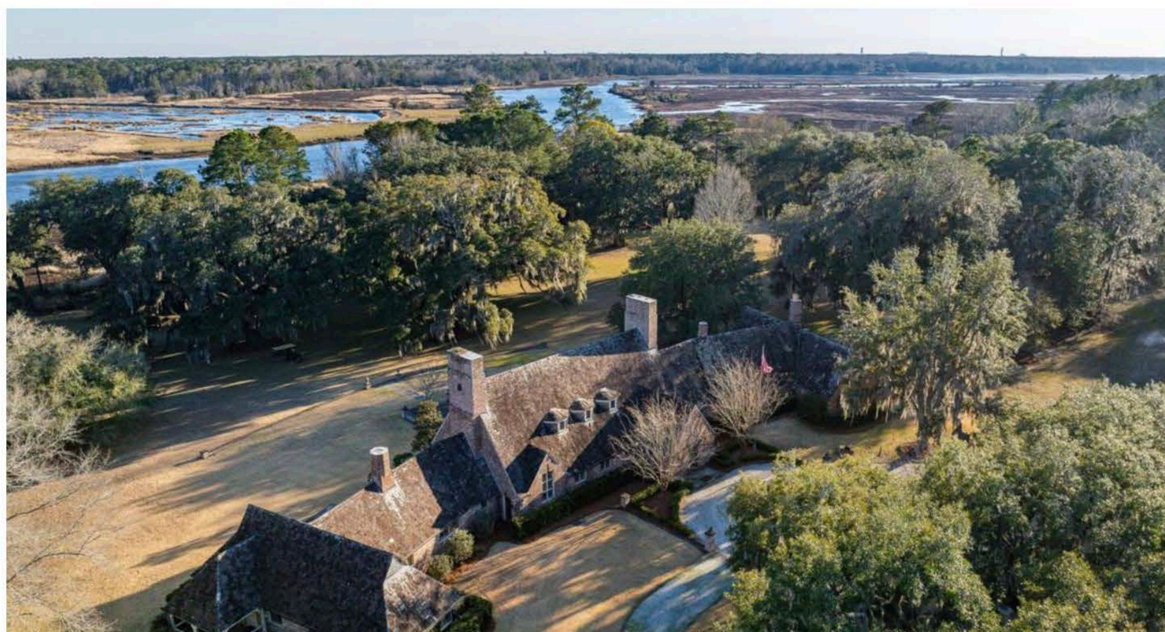
Overhead views of the Richmond Plantation property in Berkeley County, SC

With its natural charm and elegance, this Richmond estate has even been featured in the hit Netflix series, " Outer Banks ."