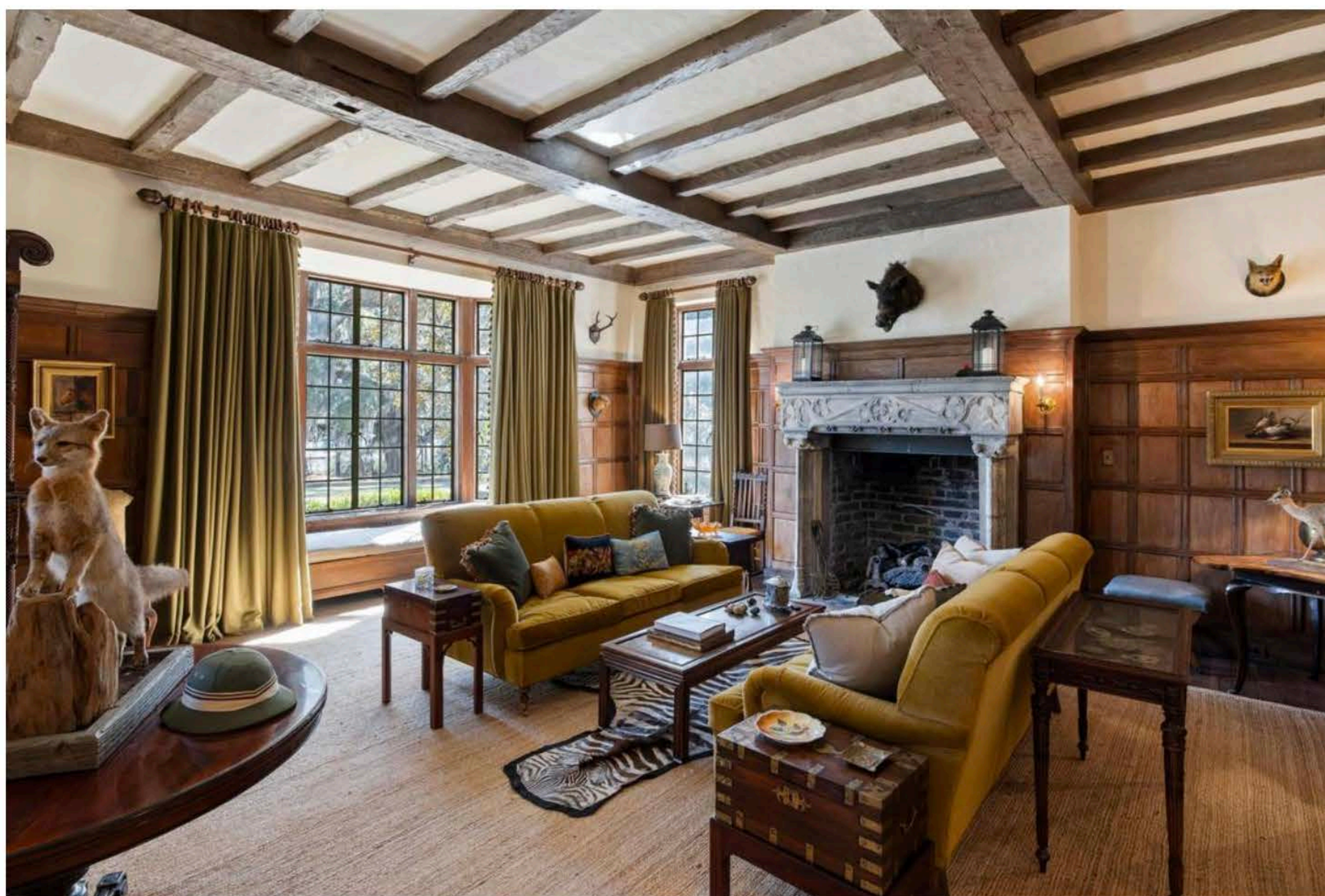
Living room of the Richmond Plantation in Berkeley County, South Carolina

The house's high-pitched slate roof, with its striking silhouette against the sky, reflects the medieval influence of the 12th century. The roof itself carries a sense of age and permanence, adding to the timelessness of the home. One of the most noticeable aspects of the design is the rich detailing throughout the property.