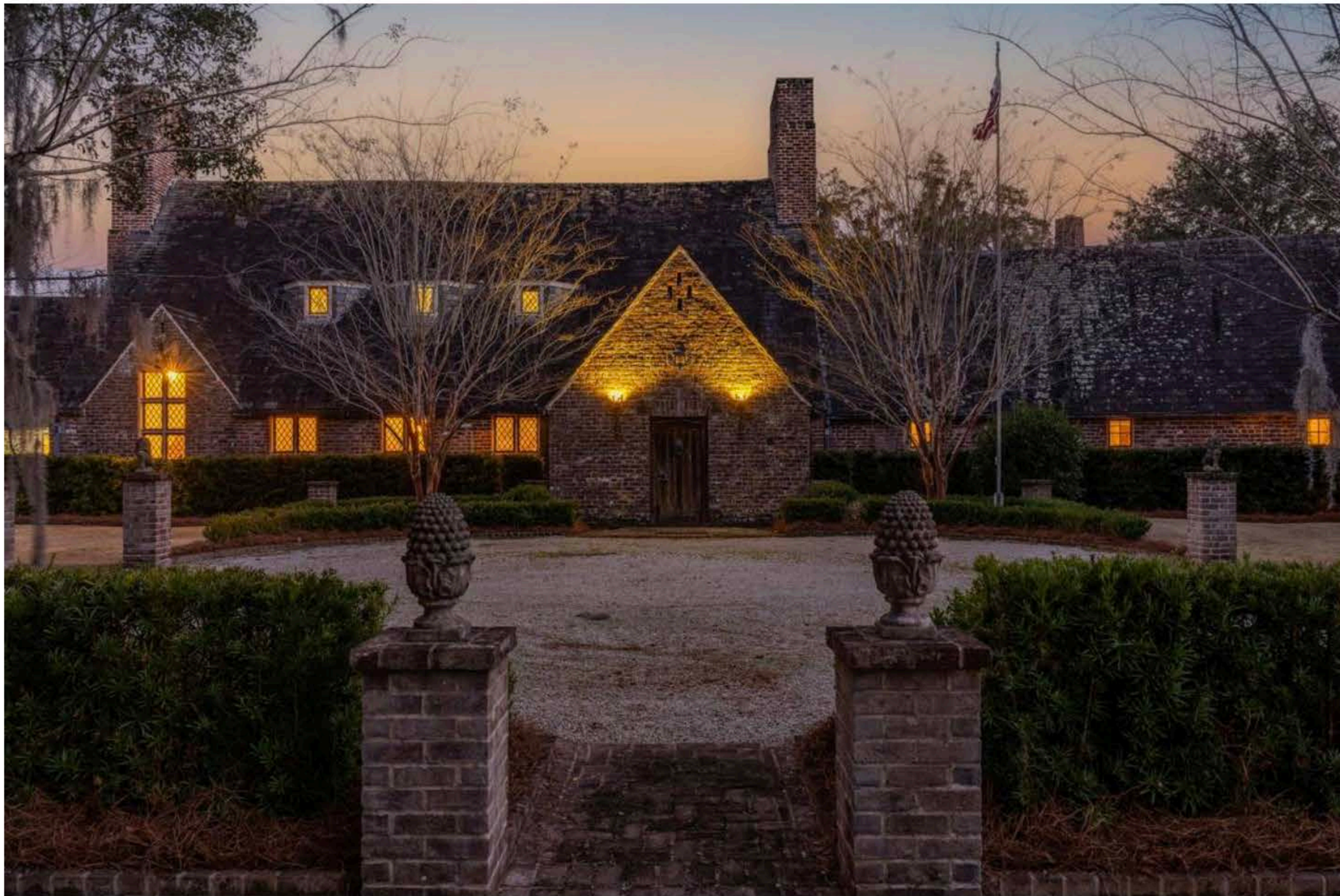
Exterior of the Richmond Plantation in Berkeley County, South Carolina

Arguably the epitome of elegance and refined living, Richmond Plantation stands out not only for its grand beauty but also for its charm, embodying a perfect blend of English undertones, medieval style and southern flare. This historic home is now on the market for $16.5 million.