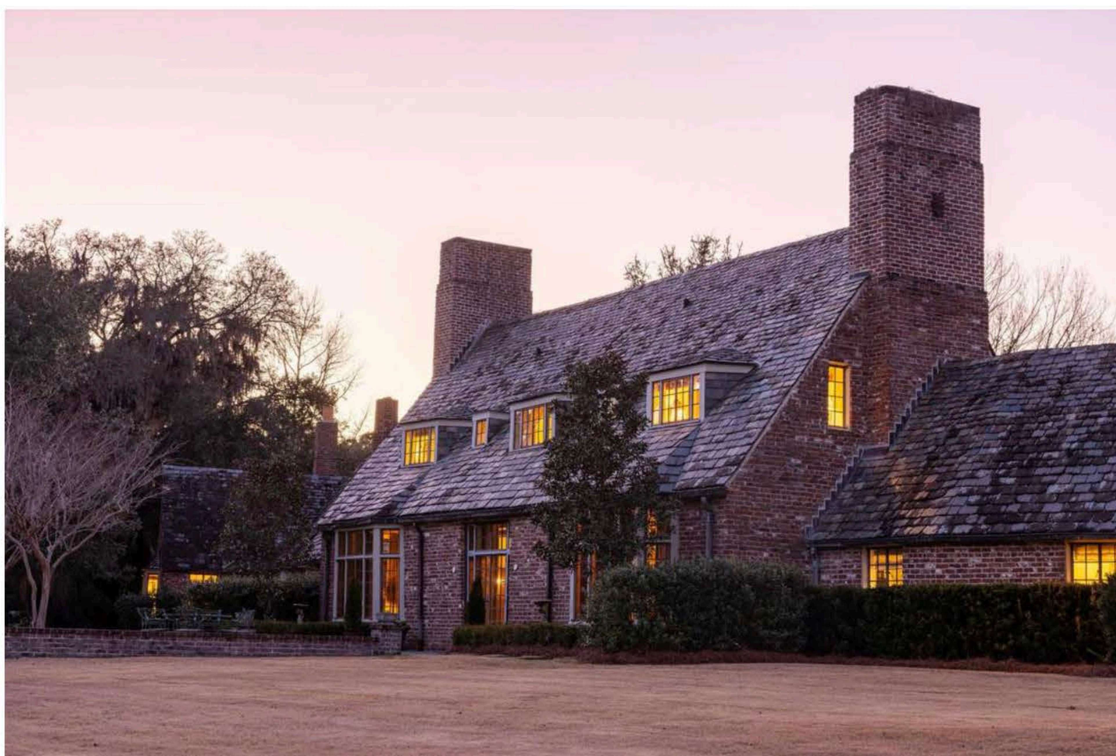
Exterior of the Richmond Plantation in Berkeley County, South Carolina