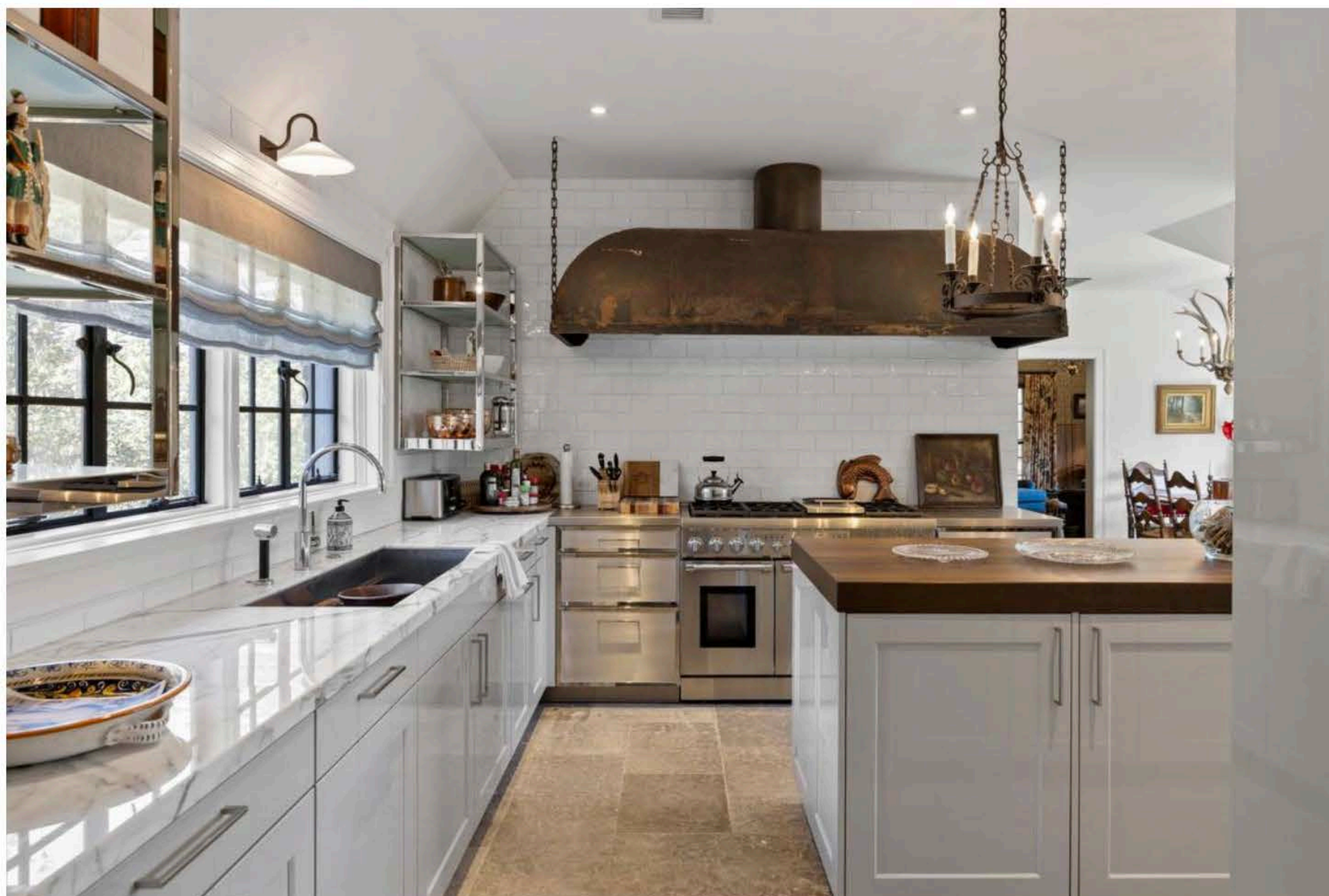
Kitchen in the Richmond Plantation in Berkeley County, South Carolina

From the perched gargoyles, casts of King Charles I, high pitched slate roofing, hand crafted woodwork, 12th century fireplace and even stone flooring, historic details are weaved into every corner.